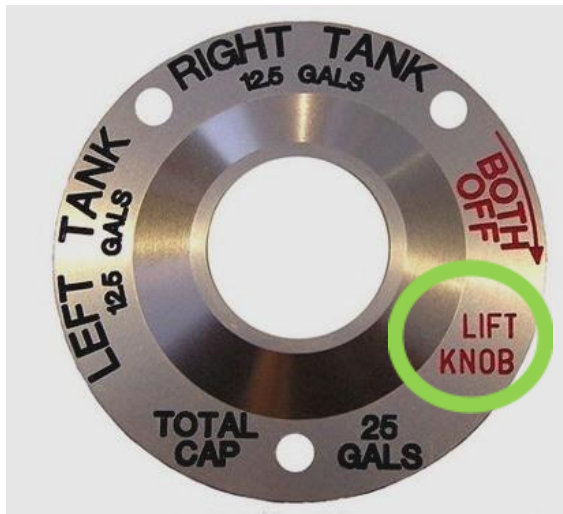
Figure 1 CORRECT