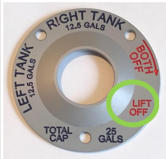
Figure 2 INCORRECT